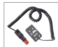
Charger for your car