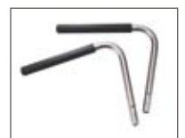
Widening of the arm rests