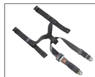
Seat belt system including hip belt